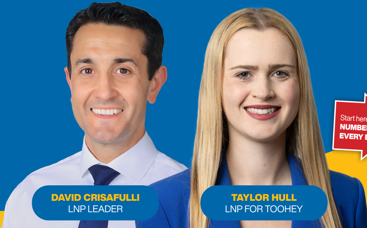
DAVID CRISAFULLI LNP LEADER