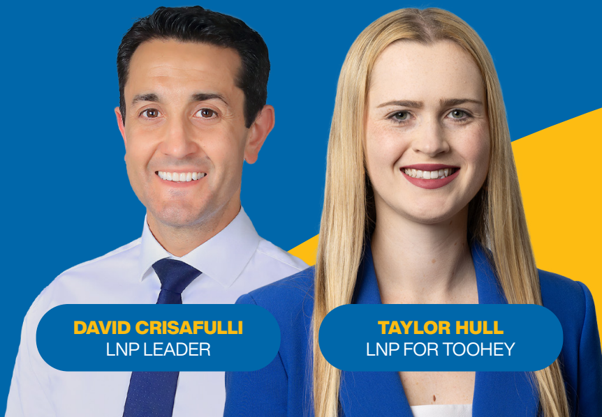
DAVID CRISAFULLI LNP LEADER