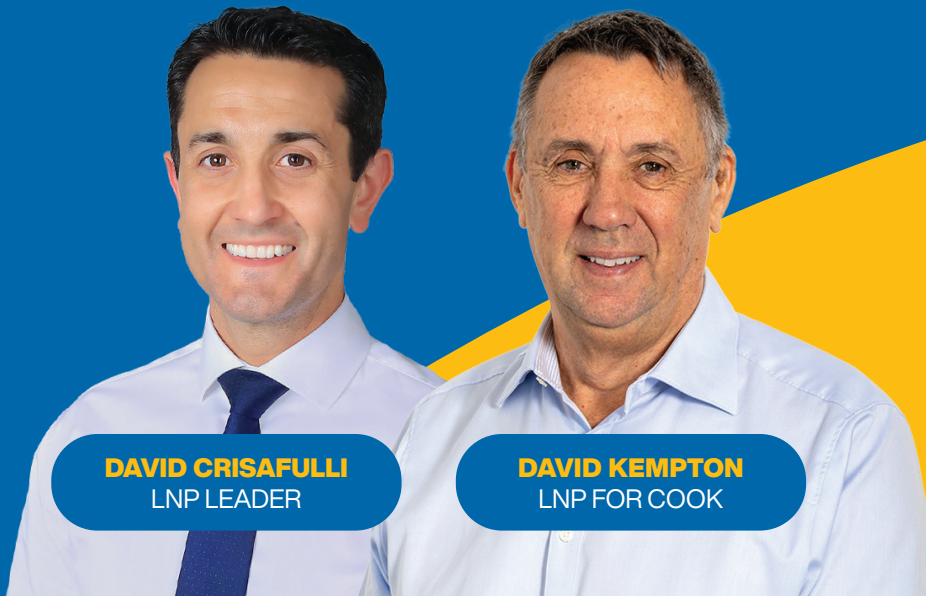
DAVID CRISAFULLI LNP LEADER