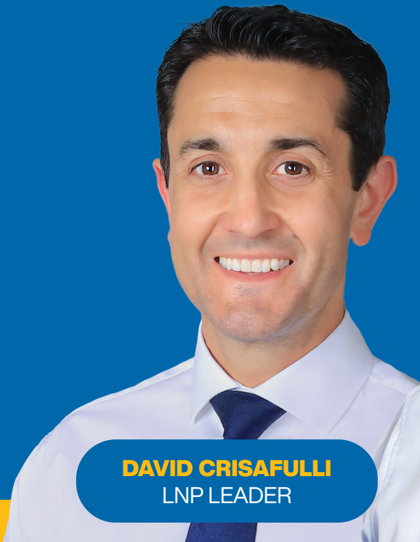
DAVID CRISAFULLI LNP LEADER