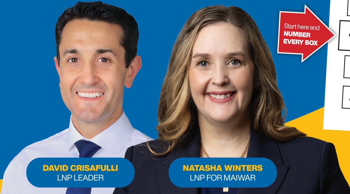
DAVID CRISAFULLI LNP LEADER