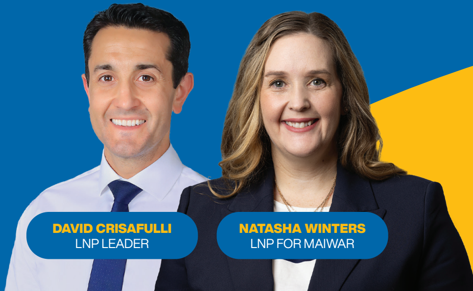
DAVID CRISAFULLI LNP LEADER