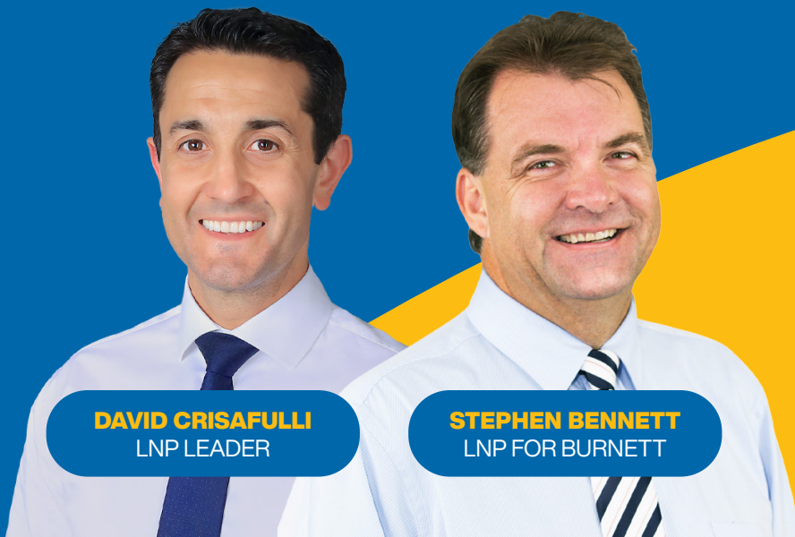
DAVID CRISAFULLI LNP LEADER