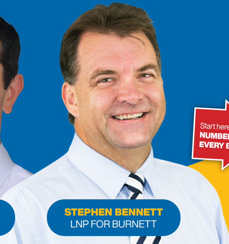
STEPHEN BENNETT LNP FOR BURNETT