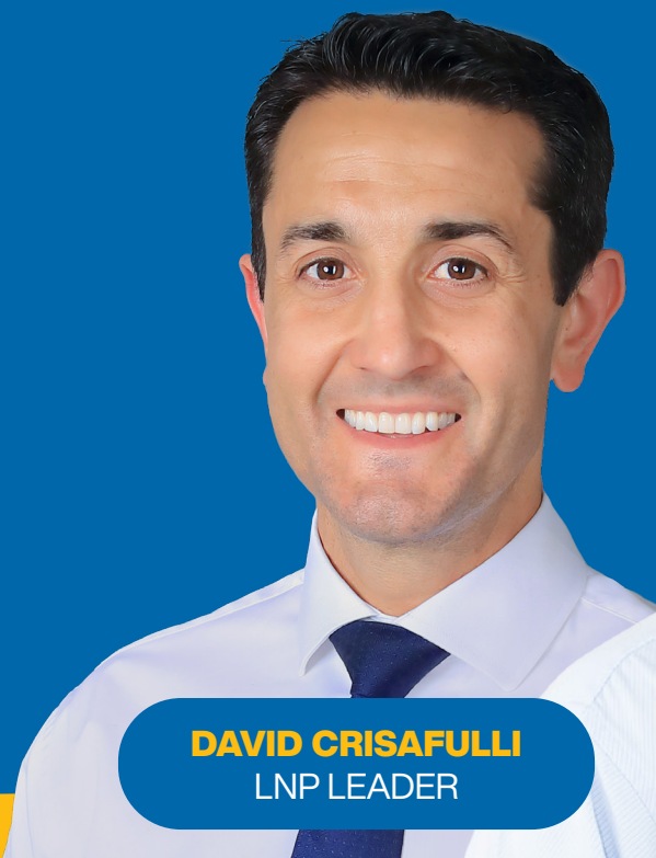
DAVID CRISAFULLI LNP LEADER