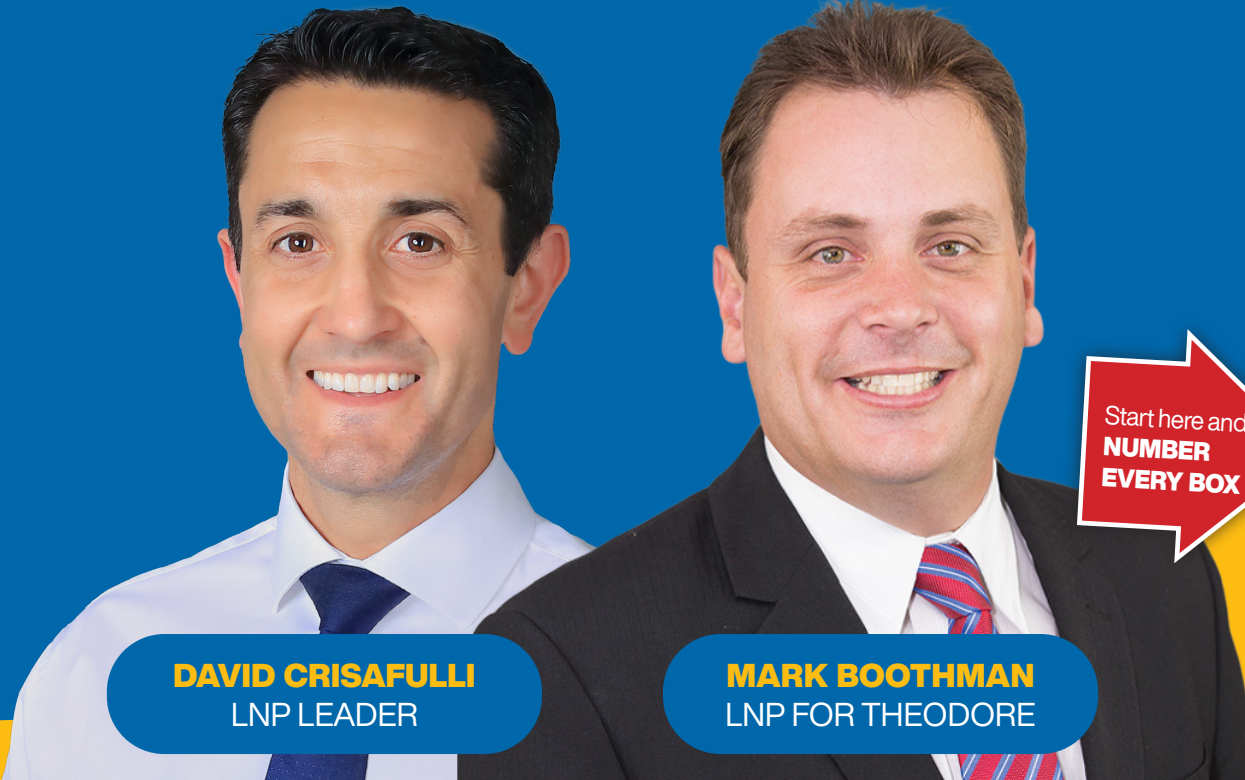
DAVID CRISAFULLI LNP LEADER