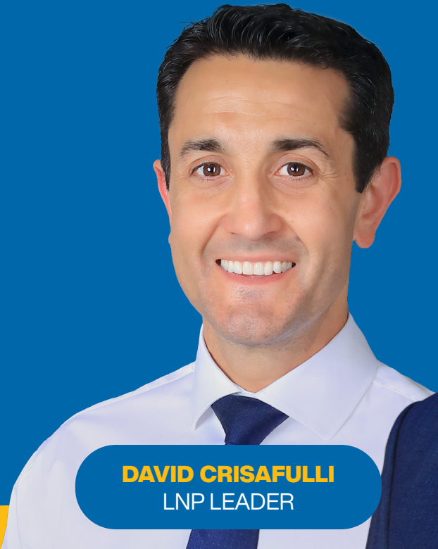
DAVID CRISAFULLI LNP LEADER