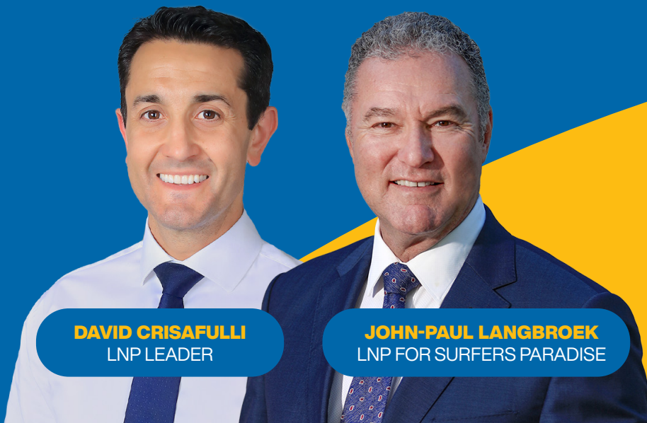
DAVID CRISAFULLI LNP LEADER