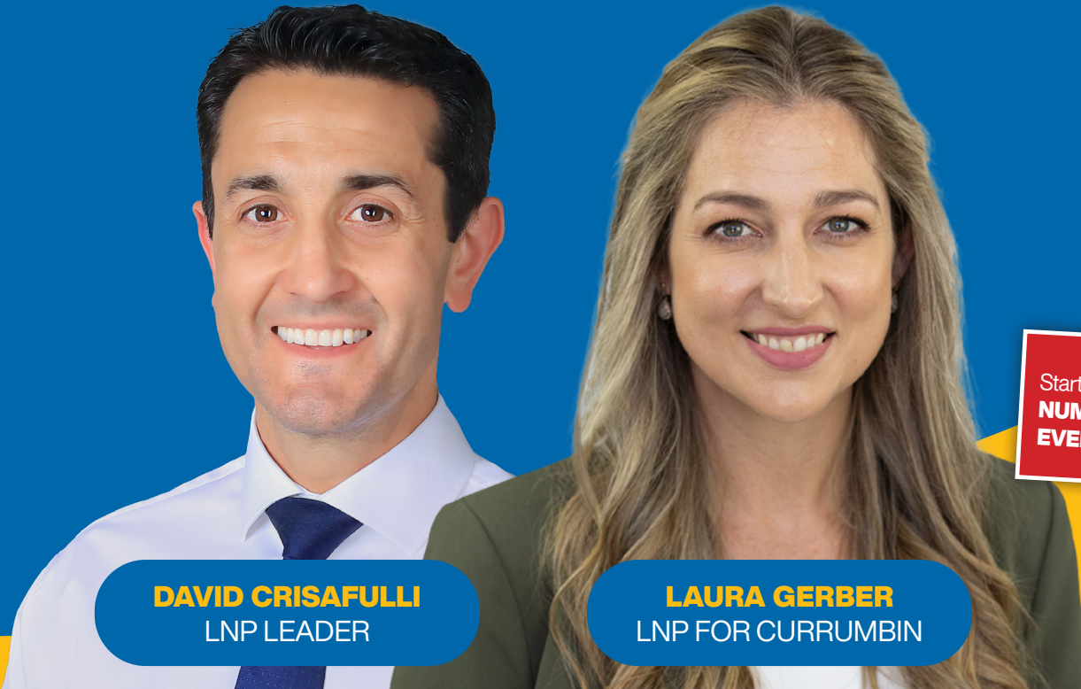
DAVID CRISAFULLI LNP LEADER