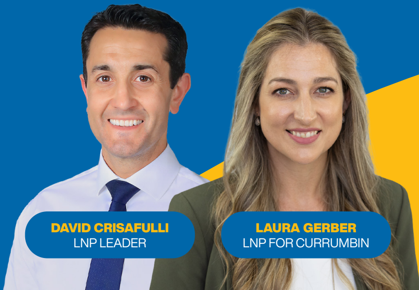
DAVID CRISAFULLI LNP LEADER