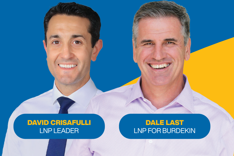
DAVID CRISAFULLI LNP LEADER