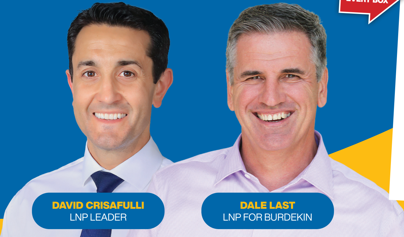
DAVID CRISAFULLI LNP LEADER