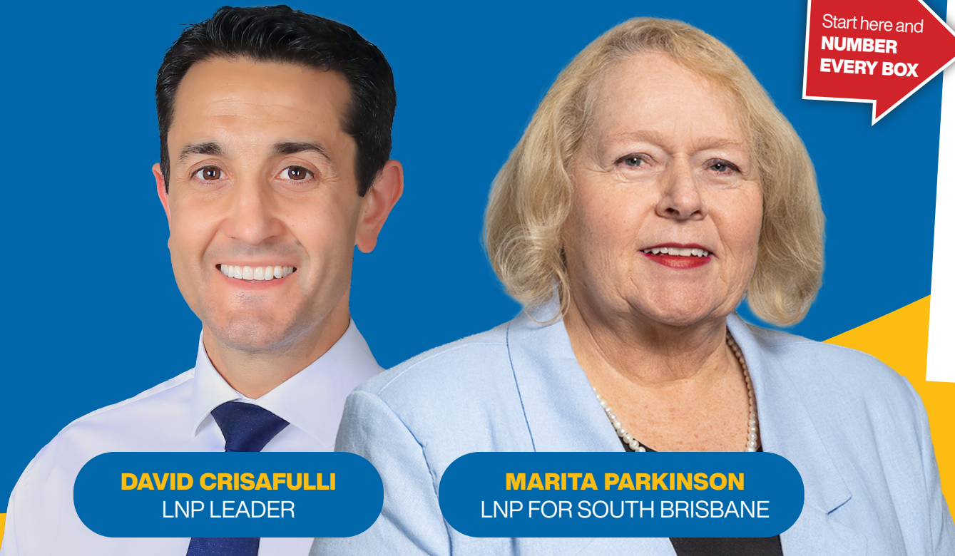
DAVID CRISAFULLI LNP LEADER