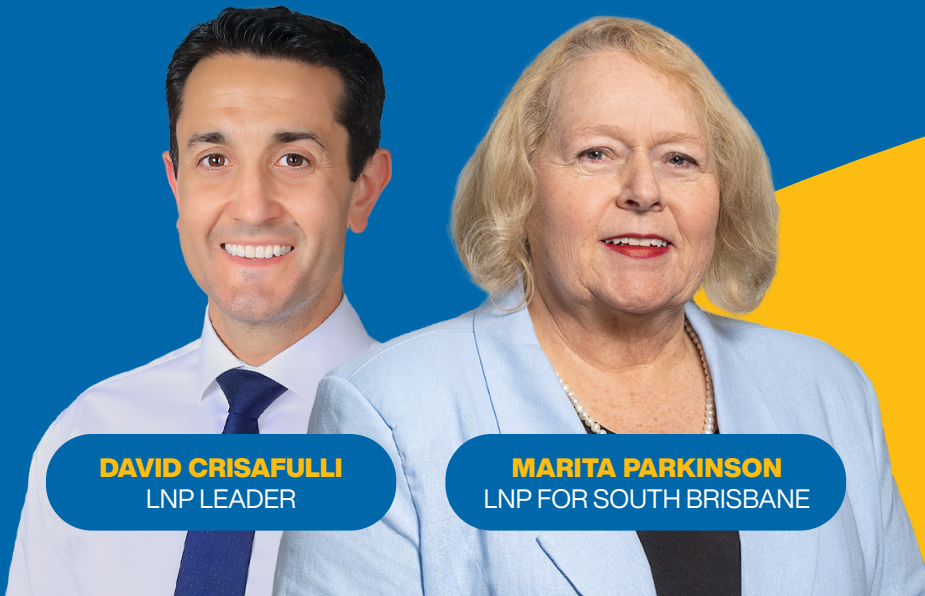
DAVID CRISAFULLI LNP LEADER